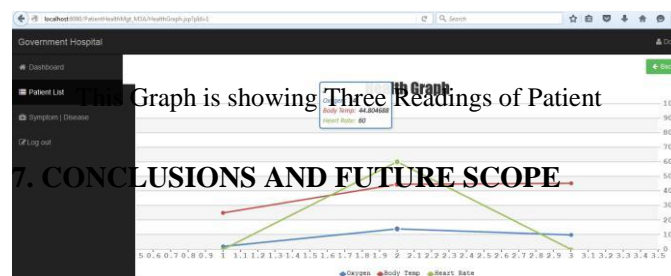
This Graph is showing Three Readings of Patient