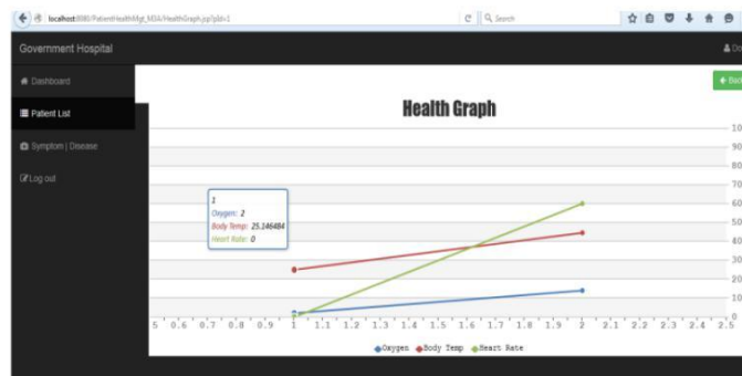
This graph is showing first Reading of Patient (With Reading one)

Here as per the (sensor) readings graph is being displayed which shows patient health record graphically (this graph automatically gets generated in our System). This readings may help doctor to monitor patients health on regular basics .