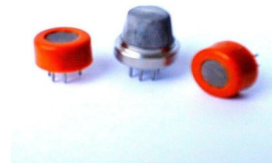
Fig .4: Co2 sensor