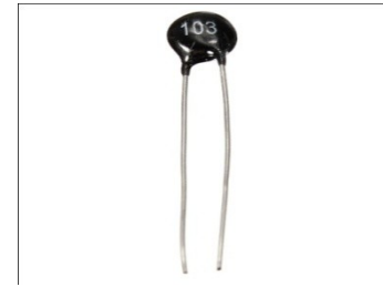
Fig.3: Temperature sensor

A thermistor is a type of resistor whose resistance is dependent on temperature. Thermistors are widely used as inrush current limiter, temperature sensors (NTC type typically), self-resetting over current protectors, and self-regulating heating elements. The TMP103 is a digital output temperature sensor in a four-ball wafer chip-scale package (WCSP). The TMP103 is capable of reading temperatures to a resolution of 1°C.