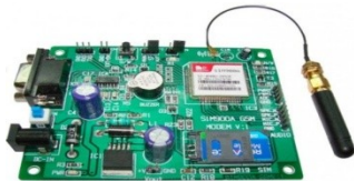
Fig.2: GPRS module

efficient way between GSM mobile stations and external packet data networks. Packet switching is where data is split into packets that are transmitted separately and then reassembled at the receiving end. GPRS supports the world's leading packet-based Internet communication protocols, Internet protocol (IP) and X.25, a protocol that is used mainly in Europe. GPRS enables any existing IP or X.25 application to operate over a GSM cellular connection. Cellular networks with GPRS capabilities are wireless extensions of the Internet and X.25 networks.