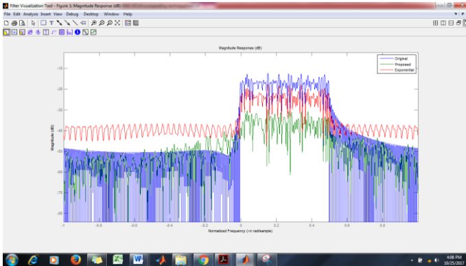
Fig:Performance curve of ofdm

Notice that the signal-to-noise ratio (SNR) in a typical additive white Gaussian noise (AWGN) Channel is much greater than