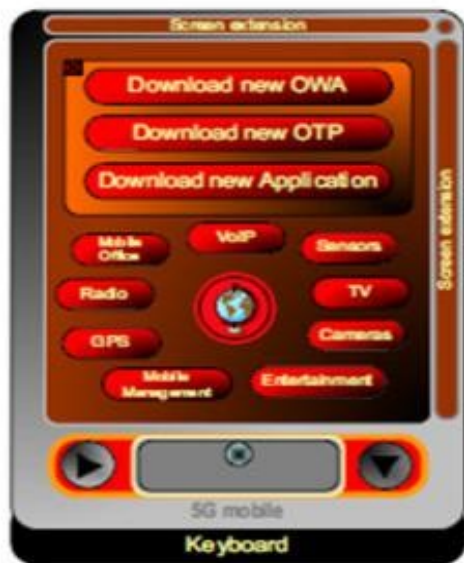
Fig. 3 5G mobile phone design

Fig.3 shows 5G mobile phone design. [12] 5G is being developed to accommodate the QoS and rate requirements set by forthcoming applications like wireless broadband access, Multimedia Messaging Service (MMS), video chat, mobile TV, HDTV content, Digital Video Broadcasting (DVB), [18] minimal services like voice and data, and other services that utilize bandwidth. The definition of 5G is to provide adequate RF coverage, more bits/Hz and to interconnect all wireless heterogeneous networks to provide seamless, consistent telecom experience to the user. [10,11]