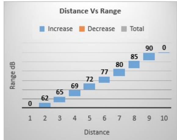
Figure 3: Distance versus signal strength

The Above graph shows the signal strength of the network with respect to distance. We observed that as we move away from network the signal strength goes on decreasing. We calculated the signal strength which is required to access network and to enjoy high speed connectivity easily, we found that the signal strength should be less than -60dB.