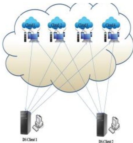
Figure 3: DepSky Architecture [14]

storage providers, where readers and writers are the client's tasks. Bessani et al. explain the difference between readers and writers for cloud storage. Readers can fail arbitrarily (for example, they can fail by crashing, they can fail from time to time and then display any behavior) whereas, writers only fail by crashing [6][9]. The Figure 3 below depicts the DepSky model with four clouds.