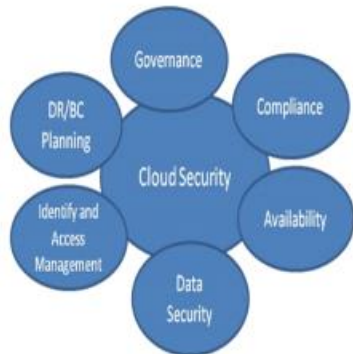
Figure 2: Measures to ensure Security in Cloud [10]