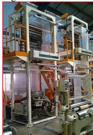
Fig 2:- Poly Bag Manufacturing Machine

To contribute to a cleaner environment by recycle plastic, the researcher use the recycled for one type of plastic is the low density polyethylene which used in producing not degradable LDPE bags, these bags become waste after short time of use, and they become important in our daily lives, and because of their low weight the air and water can be transported long distances which cause additional pollution, if incinerated or buried also non-friend to environment, the researcher recycled these LDPE bags to handy textile products as The books-holder, The mobile - holder and handy bag, been selected for this type of product to simplify the method and cost of production to promote the idea of reusing waste bags.