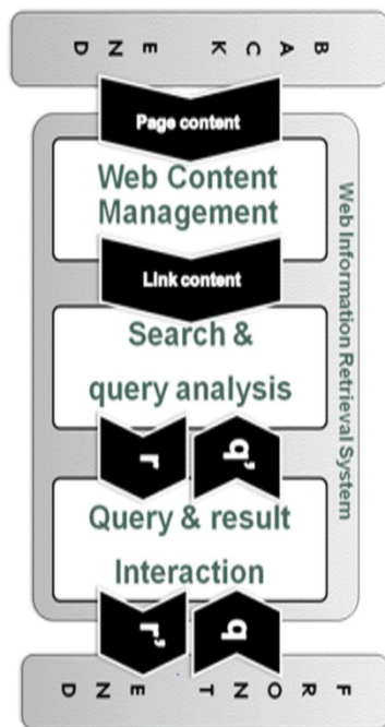
Figure 1. Web Information Retrieval Process

relevant for a user query in a collection of documents. Decades of research in WIR were successful in developing and refining techniques that are solely word-based. With the advent of the web new sources of information became available, one of them being the hyperlinks between documents and records of user behavior. The goal of WIR system in Figure 1. is to satisfy user's information need. Unfortunately, characterization of user information need is not simple. User's often do not know clearly about the information need. Query is only a vague and incomplete description of the information need.