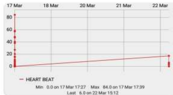
Figure.5: heart beat characteristics

The system takes the data from the IOT devices for every sixty seconds and update in the database connected to the server. The doctor can view the patients' health condition every sixty seconds. The system gets the blood pressure data and check with the Table to evaluate the status of the patient. Similarly the pulse rate is compared with the Table. For temperature the average temperature falls above 98.6°F (37°C) is considered as abnormal temperature. The data collected from the patients and its evaluation by the application, showed that the observed data is updated correctly.