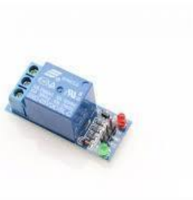
Fig4.2. Relay module

2.Relay: Relay which is an electromagnetic switch operated by relatively small electric Current that can turn on or off a much larger electric current .Relay control one electric circuit by opening and closing contacts in another circuit An relay is connected to raspberry pi in above architecture.