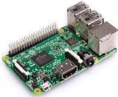
Fig4.1. Raspberry Pi3

2.Relay: Relay which is an electromagnetic switch operated by relatively small electric Current that can turn on or off a much larger electric current .Relay control one electric circuit by opening and closing contacts in another circuit An relay is connected to raspberry pi in above architecture.