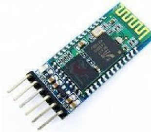
Fig4.3. HC-05 Bluetooth module

3.Bluetooth Module: HC-05 Bluetooth module is shown in Fig:4.3.It is wireless technology standard used to exchange the data between two Bluetooth devices within the range of 10m approximately .It Operates in the frequency range from 2.4GHz to 2.4835 GHz.The module dimensions are 12.7mm *27mm.