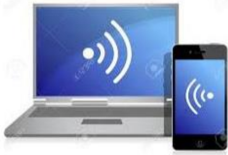
Fig2: Monitoring section

ARM7 (LPC2148) The LPC2141/42/44/46/48 microcontrollers are based on a 16-bit/32-bit ARM7TDMI-S CPU with real-time emulation and embedded trace support, that combine the microcontroller with embedded high-speed flash memory ranging from 32kB to 512 kB. The LPC2141/42/44/46/48 microcontrollers are based on a 16-bit/32-bit ARM7TDMI-S CPU with real-time emulation and embedded trace support, that combine the microcontroller with embedded high-speed flash memory ranging from 32 kB to 512 kB. A 128-bit wide memory interface and a unique accelerator architecture enable 32bit code execution at maximum clock rate. For critical code size applications, the alternative 16-bit Thumb mode reduces code by more than 30 % with minimal performance penalty. Due to their tiny size and low power consumption, LPC2141/42/44/46/48 are ideal for applications where miniaturization is a key requirement, such as access control and point-of-sale. Serial communications interfaces ranging from a USB 2.0 Full-speed device, multiple UARTs, SPI, SSP to I2Cbus and on-chip SRAM of 8 kB up to 40 kB, make these