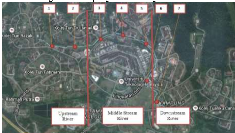
Figure 1: 7 sampling stations along UTM River.

Water samples are collected along the UTM River with 7 sampling stations is determined based on upstream river, middle-stream river, and downstream river (Figure 1). The water samples are collected using 'grab sampling' and it will be analyzed based on physic-chemical parameter namely Dissolved Oxygen (DO), acidic/basic water (pH), biological oxygen demand (BOD), chemical oxygen demand (COD), suspended solid (SS), and ammoniacal nitrogen ( \text{NH}_3\text{N} ) [1; 5; 6]. Meanwhile, analysis of physic-chemical parameter is divided into two categories, namely in-situ and laboratory analysis. In-situ analysis will involve with DO and pH, while laboratory analysis involve with BOD, COD, SS and \text{NH}_3\text{N} . Raw water sample are analysis based on APHA 2005 methods, for example BOD based APHA 5210-B, COD based APHA 5220-C, SS based APHA 2540-D, and \text{NH}_3\text{N} based 5220-C. Before collecting data for water quality assessment, site observation is carried out to determine the access of sampling area to avoid difficulties in obtaining the results [10-12].