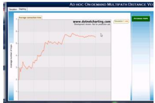
Fig 5: average number of hops and average connection time simulation graph

Figure 4 shows results of time complexity. This graph made between transition services and time