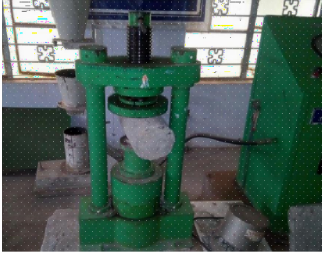
Fig -3: Split Tensile Strength Testing Machine