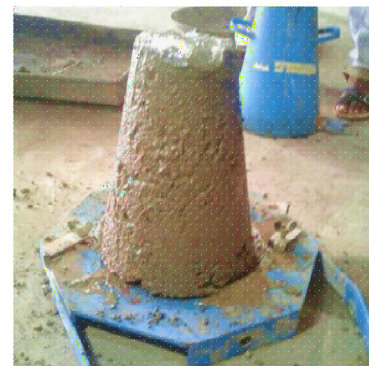
Fig -1: Slump Cone Test

Immediately the cone is lifted in an upward direction.