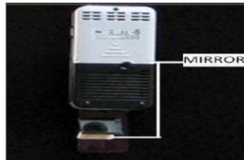
Fig 4 Mirror

Mirror is placed just below the projector. The projector can project the information in any direction with the help of a mirror which can be tilted in any direction as per the user's requirement.