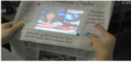
Fig 12 Video Newspaper