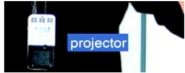
Fig3. – Projector

The projector is basically an output gadget which is used to display any information provided by the mobile component. Projector can project information on any kind of physical surface such as a wall, palm of user's hand, a paper etc. and the user can interact with it.