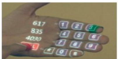
Fig 9 - Palm Dialer

This technology enables the user to call without using the dialer. The dialer will be projected as soon as user brings the palm in front of the device. The user does not need a mobile phone to make the call rather the virtual keypad it projected on the palm.