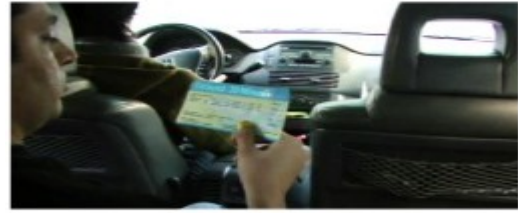
Fig 10.- Video Newspaper

The device can also tell the user whether the flight is delayed or is on time by looking at the ticket.