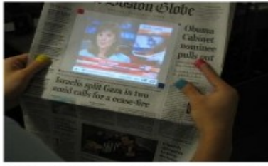
Fig 8 - Video Newspaper