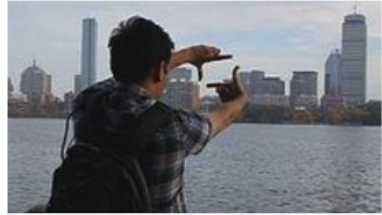
Fig 7. - Capture images

In order to snap a picture, the user has to make a rectangle in air as shown in Fig . The picture will be taken and it will be placed in memory card. A person can resize and edit it whenever needed by projecting it on any hard surface like wall