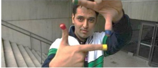
Fig 6 - Color Markers

This technology makes use of four color markers: red marker, green marker, blue marker and yellow marker. The user can wear these markers at the tip of their fingers which helps the camera to track hand gestures. These gestures can perform various tasks such as painting, taking a picture and many more.