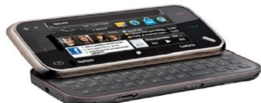
Fig 5.- Mobile Component

One of the most important components of this technology is the mobile module. The function of this component can be carried out by any device such as smartphone, personal digital assistant, laptop etc. as long as it is mobile and web enabled. It is a processing engine that processes the data obtained from camera and sends the output to projector.