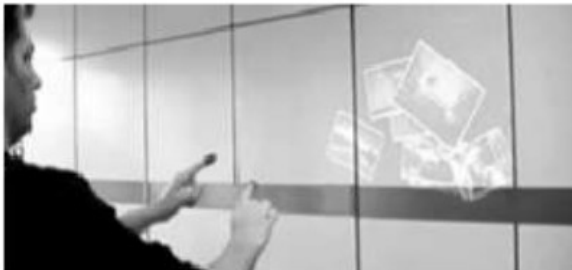
Fig 13 Picture Zoom In / Zoom out

This is the basic feature used by the students while doing case study. The miniature content of the books can be magnified to focus more light on it. The user can zoom out or zoom in using intuitive hand movements. By the use of this technology, user can focus on deep study of the articles without using computer. Secondly, pictures can be magnified and contents can be deeply visualized.