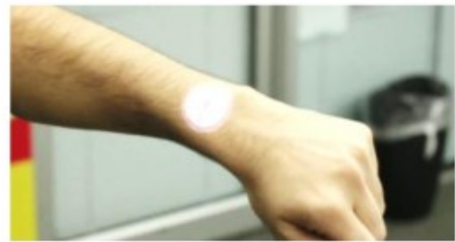
Fig 11 Video Newspaper

The user just needs to make a gesture of a circle on the wrist and the clock with current time will be projected on the user's hand.