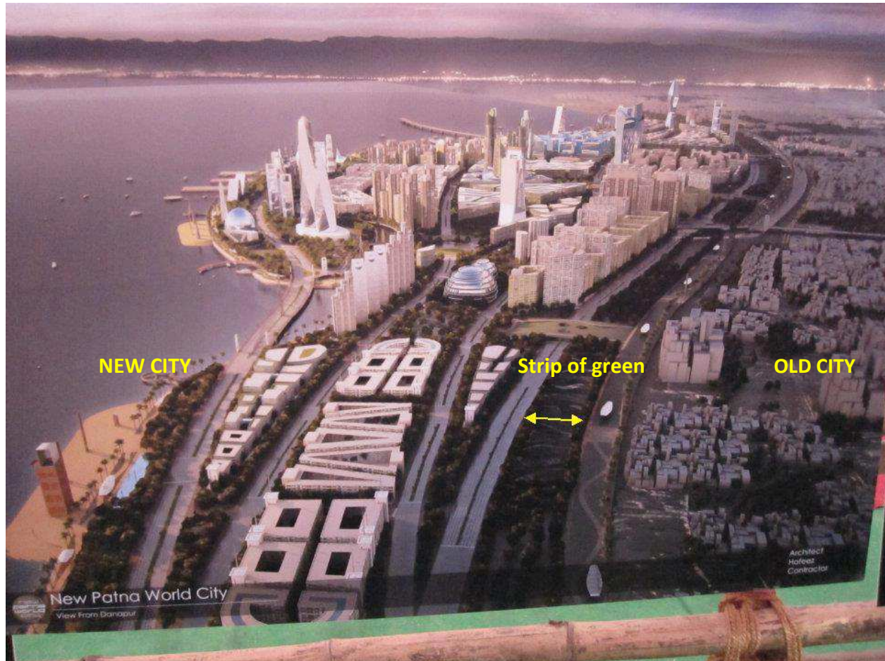
Figure 4: Connection between NPWC and old Patna

the proposal. What could have been endless possibilities of urban integration and upgradation has simply been swiped by a stretches of green at the junction between the new and old development as shown in figure.