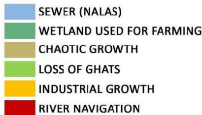
Figure 2: Present relation between river and city

At present there has been a loss of 15 kilometers of riverfront from the old city due to the shifting of river, which has resulted in poor urban image along the edge of the city.