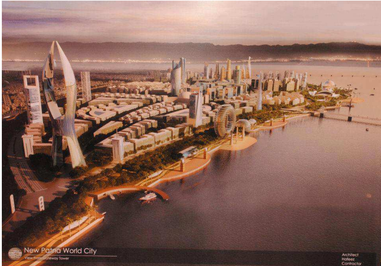
Figure 3: Three dimensional rendering of proposed NPWC

The proposal has tried to capture the eyes of all the stakeholders alike through global images and claims which carves out a promise of better future. However critical analysis of the proposal tells a different story.