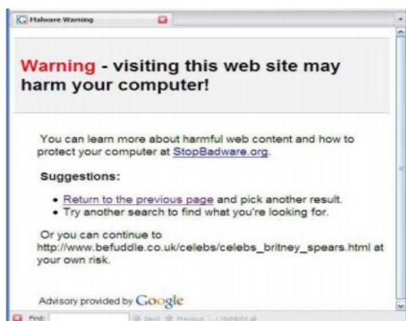
Fig 3. Example of a warning message from an unsafe site

confidential information submitted to a given website. Such anomalous behavior indicates that the website is being used for phishing. Responsive to detecting the anomalous behavior, further action is taken to protect users from submitting confidential information to that website. For example, an alert can be sent to an appropriate party or automated system, a protective measure against the site can be published, the site can be added to a blacklist, or a procedure to have the site shut down can be initiated.