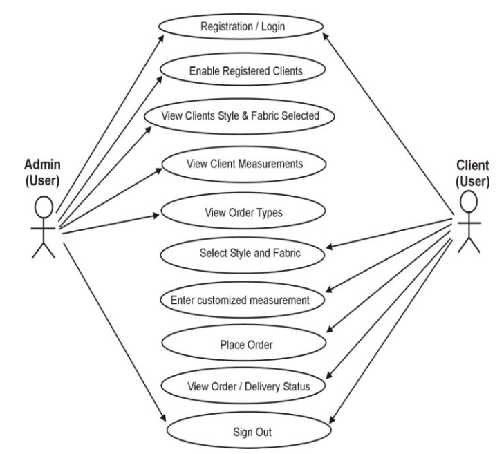
Figure 2 use case diagram showing admin & client interaction with the system

Use case diagram is a representation of a user's interaction with the system. Figure 2 shows the use case diagram for the different types of user, and also it portrays the users interaction with the system and its features at their various levels, i.e. the admin and client users respectively.