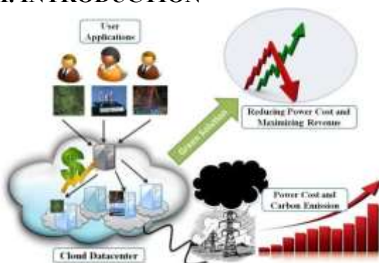
Fig.1: Green Cloud Computing

Green Cloud computing model that achieves not only efficient processing and utilisation of computing infrastructure, but also minimise energy consumption .