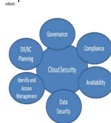
Figure 2: Measures to ensure Security in Cloud [10]

Logs need to be carefully constructed to appraisal the Actions of their system administrators and other restricted users or risk producing reports that mix events relating to different customers of the service. Both the organizations seeking cloud solutions and the service providers have to ensure cloud security is addressed [8]. Some of the measures to ensure security in cloud are good governance, compliance, privacy, Identity and Access Management (IAM), Data protection, Availability, Business Continuity and Disaster Recovery plans etc. The figure (Figure 2) below depicts the above mentioned security measures in a snapshot: