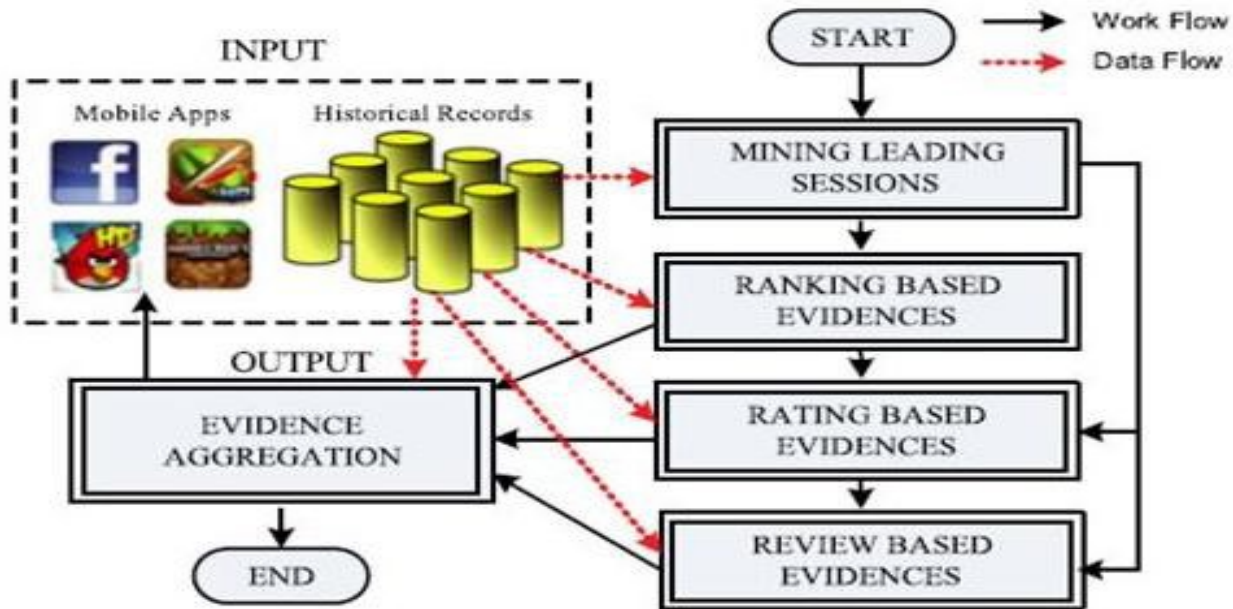
Figure 1: System Architecture

The ranking based evidences can be affected some Apps' developer reputation and some legitimate marketing campaigns, such as —limited-time discount|. This method is not enough to detect fraudulent Apps' so we propose two new methods of fraud evidences based on Apps' historical rating and review records. Additionally, we developed an unsupervised evidence-aggregation method to integrate these types of evidences.