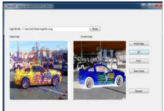
Fig. 3 Features of Original Image