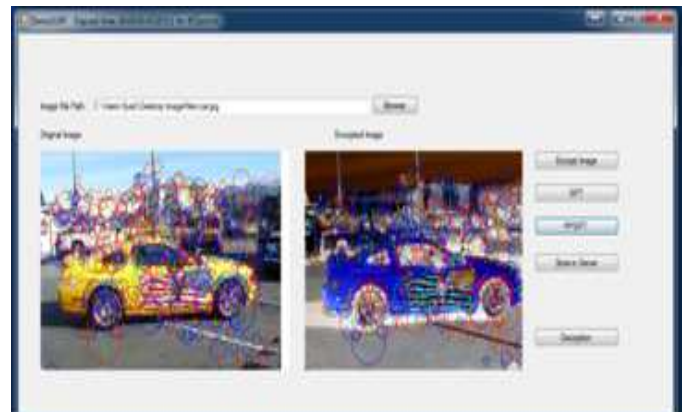
Fig. 4 Comparative Features of Original and Privacy Image