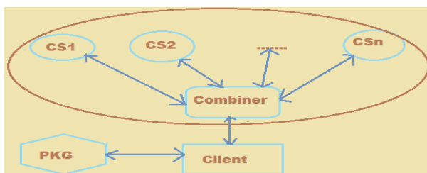
Fig 1:ID-DPDP Architecture

(iv)PKG (Private Key Generator): an entity, when getting the identity, it outputs the representing private key