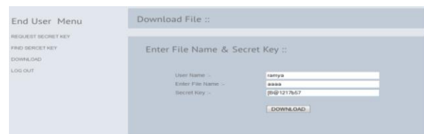
Fig 4: For Data Download Enter Secret Key Process.