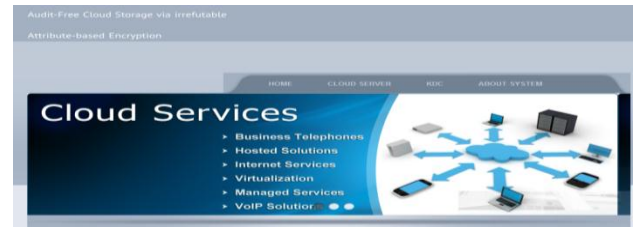
Fig 1: Home Page.