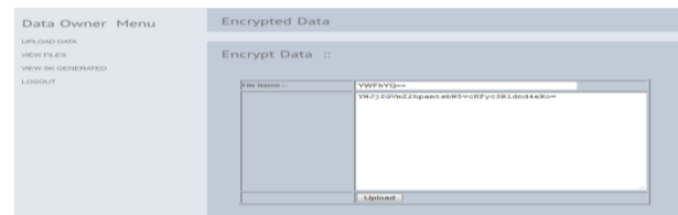
Fig 3: Data with Encrypted Format.