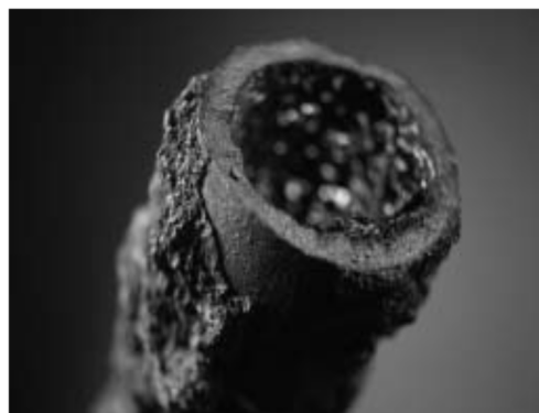
Some biofilms cause serious problems when they establish colonies inside Metal piping and hasten corrosion.

Owing to these enormous potential in role of ExoPolySachharide Secreting Bacteria, we worked towards isolation and characterization of such bacteria's from various available sources with a vision to find potential solutions to day-today problems of mankind associated with it.