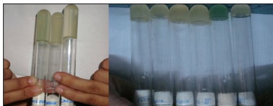
Fig. 4 → Control Inoculum for Characteristic Analysis