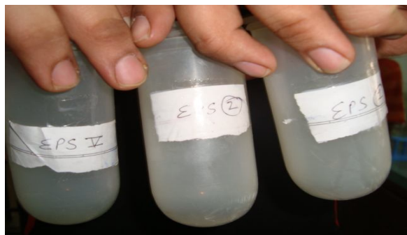
Figure 2. → Screening for EPS Production

Screening for exopolysaccharide production was done by inoculating bacterial growth in exopolysaccharide detection medium for 48 to 72 h. After incubation the exopolysaccharide produced by bacteria was precipitated by adding chilled Ethanol in the supernatant of broth. A fine network formed in upper layer of solvent showed exopolysaccharide and that comes to the top of the solvent layer.