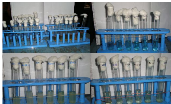
Fig. 5 → Heavy Metal Resistance Testing for selective EPS Strains & their Analysis

Samples which showed considerably good amount of EPS production were isolated and purified colonies were then prepared. Further, these purified colonies were subjected to heavy metal resistance test using metals Pb, Cu, Zn and Fe and the obtained results are tabulated below.