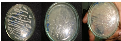
Fig. 3 → Soil samples cultured on Petri Plates for EPS Production

Those samples which gave excellent EPS production (viz. EPS I, EPS II, EPS V) were selected and purified colonies so obtained were subject to characterization.