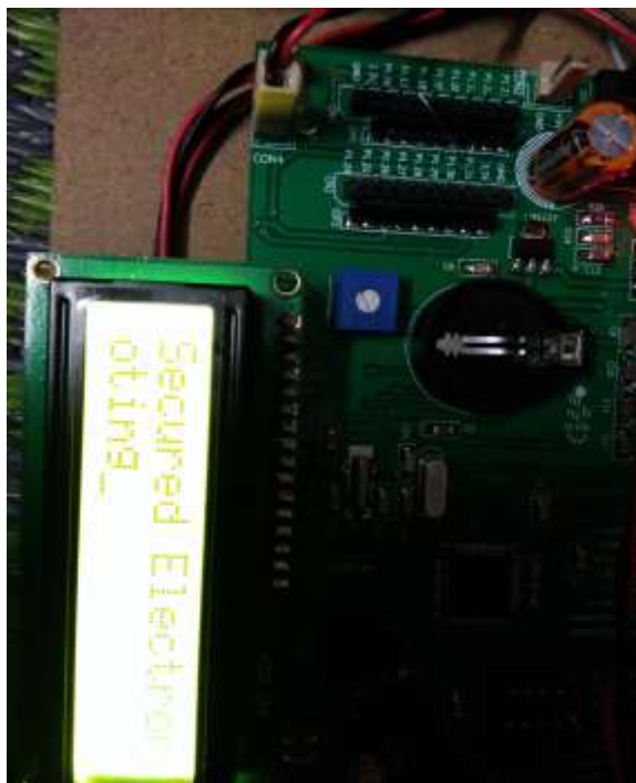
Fig: Displaying Title