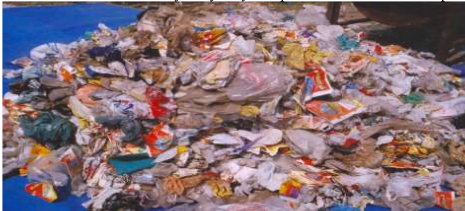
Figure 1. Waste Plastic collection [9]

Segregation Process: In this process the total plastic wastes from different places are collected and must be separated from other waste sources. The maximum thickness of the plastic should not be more than 60 microns. The Low-Density Poly ethylene plastic should be taken separately.