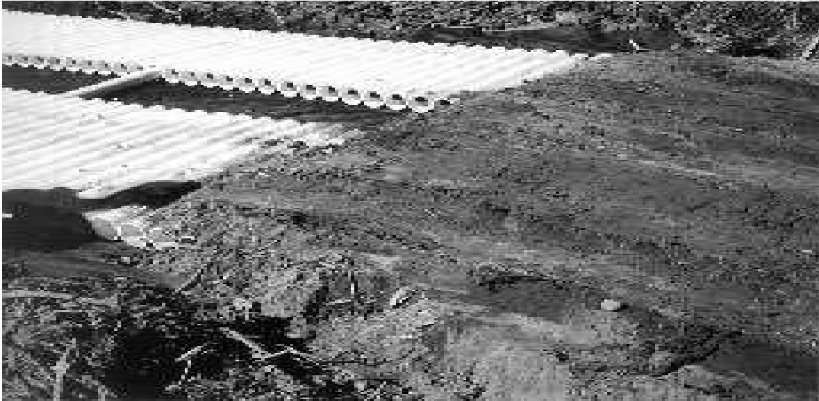
Figure 5. Transition Mats [7]

The usage of plastic waste in construction of roads came into existence in the year 1911 in Michigan State. During first world war they used the PVC pipes in form of transition mats for the transportation of war equipment's from one part to another part. The "Transition mats" consists of successively large pipes which ease the transition of tires from the approach onto plastic roads. Making the primary 2-inch pipe within the mat to support wheel a lot of schedule 80 will increase mat durability. The transmission mats increase the environmental sensitivity by eliminating the necessity for ramping up to plastic road with soil, that typically must be borrowed from somewhere. The use of transition mats reduces the forces enforced on the plastic roads when the tire rolls on it. The longitudinal forces tend to expel the plastic road in the direction that the vehicle moves leading to the gaining of set of soil. Absence of this set will lead to the soil aerating and increased rutting as the plastic road slides and point loads from individual pipe vary in location of soil.