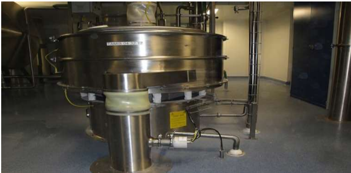
Figure4: Collection of Plastic [9]

3.4 Collection Process: In this process the plastic which was shredded will be collected in sieve analysis machine. When the machine was turned on it will starts vibrating and the materials get sieved automatically and they will pass through different layers of the machine. For mixing as a binder, we need finely processed plastic. The plastic which is left after passing through the 4.75 and 2.36 mm sieves will be collected and will transferred into another chamber for mixing process [9].