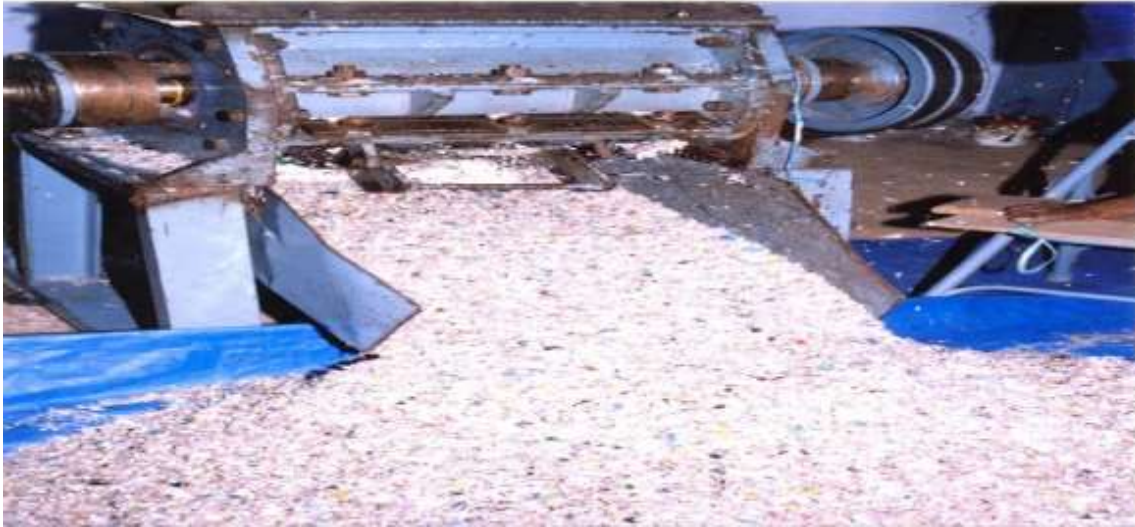
Figure3: Shredding of Waste Plastic [9]

3.3 Shredding Process: In this process the plastic cleaned will be sent through the shredding machine and the waste particles are shredded into small pieces of required size. The shredded plastic will in of different colors but the material composition is same. Even after the cleaning process some unnecessary particles will be present in the mixture and this can be identified and be removed by manually or during sieve analysis process.