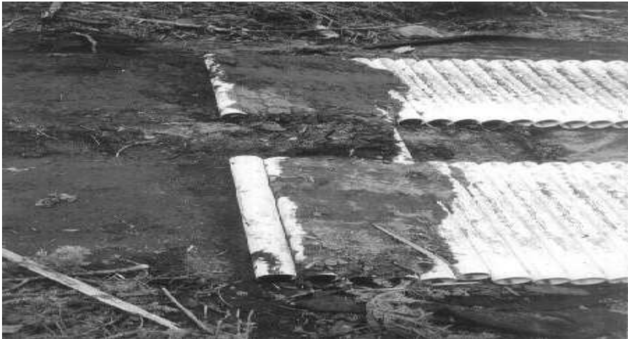
Figure 6: Plastic Road Worked out from Soil Ramp [7]