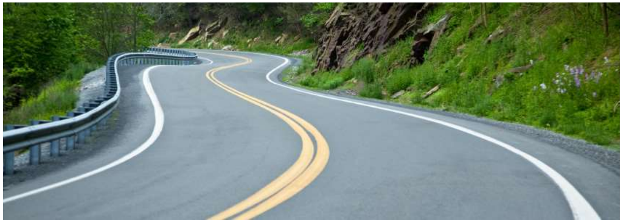
Figure 7. Road made of Plastic [6]