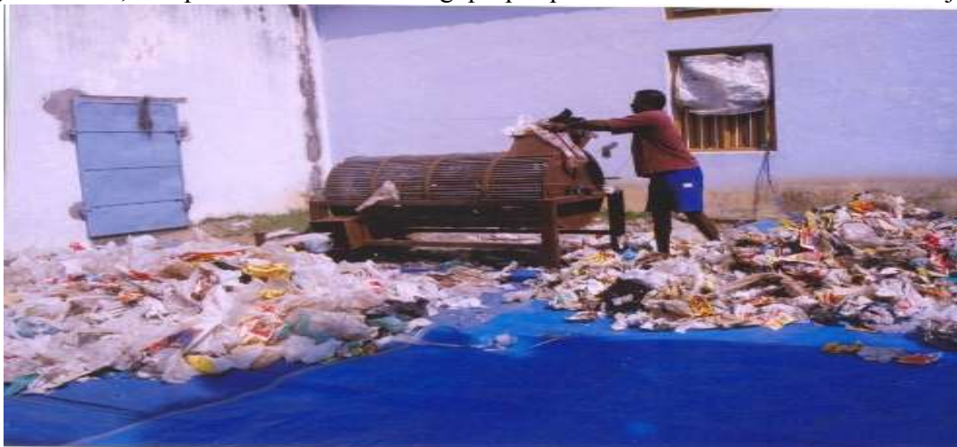
Figure 2. Cleaning of Waste Plastic [9]

3.2 Cleaning Process: In this process the plastic collected will be washed with chemicals and will be dried. The cleaning process should be done with high care because the additional of chemicals in more quantities may lead to decomposition of plastic with release of harmful toxic gases. While adding chemicals, the person should be having proper protection wear in order to avoid injuries.