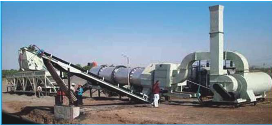
Figure 8. Hot Mix Plant [8]