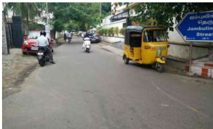
Figure 9: The Plastic Road in Chennai [11]

This environmentally conscious approach of road construction was started 15 years ago, in India in response to the growth of plastic junk. As the time goes on the polymer roads have proved to be surprisingly durable, winning support and been accepted in other countries. The Plastic roads have not developed any potholes, rutting, raveling, even after four years of laying the pavement which was mentioned in the report submitted by “Indian Central Pollution Control Board”. There are more than 21,000 miles of plastic roads in India out of which more than half of the roads are in Tamil Nadu state only. Large number of rural roads and small number of roads are built in cities like Chennai and Mumbai are plastic roads only. Addition of flexible polymers to asphalt had come into practice in 1970’s in Europe. Now North America is having 35% share of global market.[11]