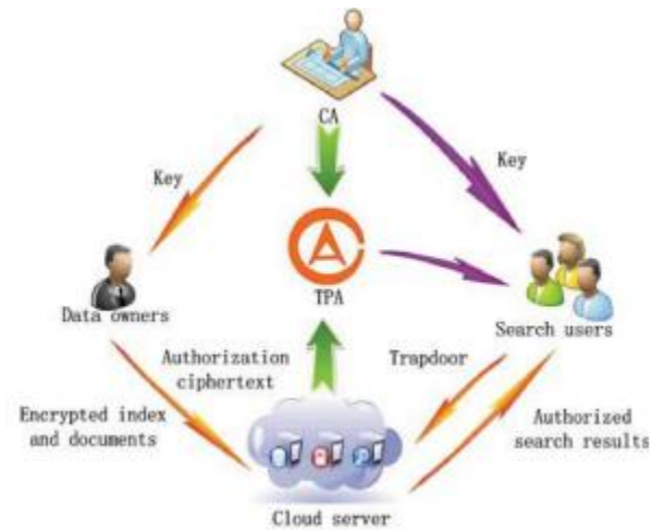
Fig No 1. Hash Sub Tree Designed

advantage over the traditional method in the Rank Privacy as relevant documents.