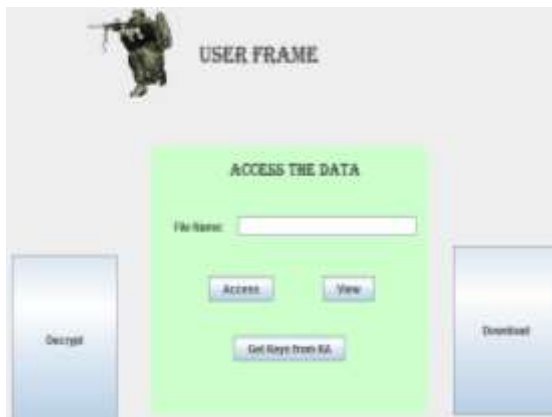
Fig 2: Customer Access Data Page.