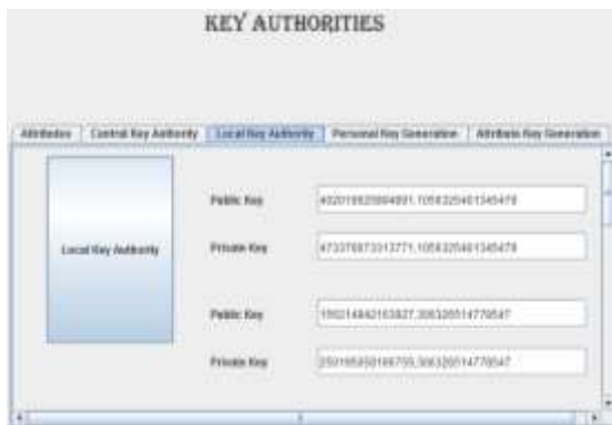
Fig 3: Public and Private Key Generation.