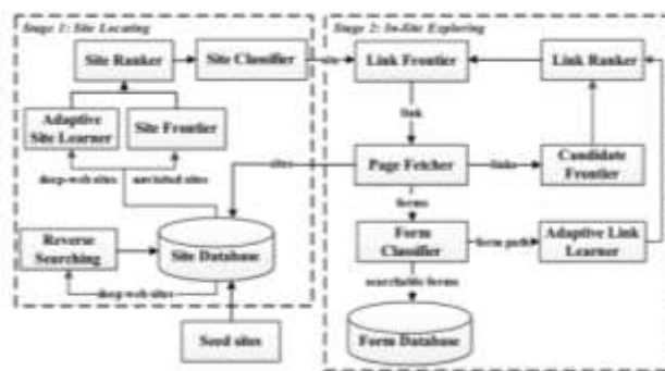
Fig 2: The two-stage architecture of SmartCrawler.

site locating stage finds the most relevant site for agiven topic, and then the second in-site exploring stage uncovers searchable forms from the site. Specifically, the sitelocating stage starts with a seedset of sites in a site database. Seeds sites are candidate sites given for A Smart Web Crawler to start crawling, which begins by following URLs from chosen seed sites to explore other pages and other domains. When the number of unvisited URLs in the database is less than a threshold during the crawling process, A SmartWeb Crawler performs reverse searching of known deep websites for center pages (highly ranked pages that have many links to other domains) and feeds these pages back to the site database. Site Frontier fetches homepage URLs from the site database, we going to rank the relevant information.