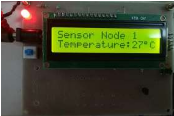
Fig. 3. Control Unit