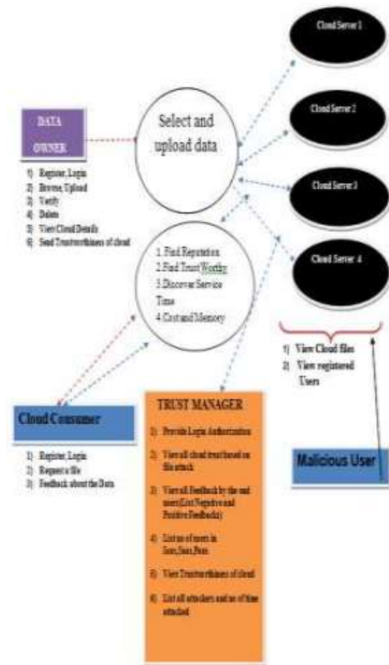
Figure 1. Trust Management Service

problem in the unpredictable number of users and the highly dynamic nature of the cloud environment [3]. Approaches in require understanding of users' interests and capabilities through similarity measurements or operational availability measurements are inappropriate in cloud environments. TMS should is modify and highly scalable to be functional in cloud environments [4]. High accessibility is a vital prerequisite to the trust administration. System proposes a few conveyed hubs to oversee criticisms given by utilizations redistributed. Load balancing is used to share the workload many lines each keeping up an interest accessibility level. The quantity of TMS hubs is resolved through an operational quality metric. Replication procedures are uses to minimize the effect of inoperable TMS occurrence. The quantity of reproductions for every hub is resolved through a replication find metric that present [5].