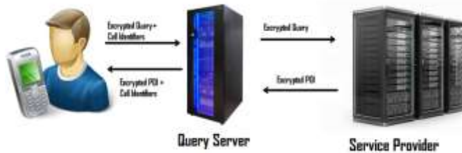
Fig: 1. Architecture

the user encrypts a query that includes the information of the query area and the dynamic grid structure, and encrypts the identity of each grid cell intersecting the required search area of the spatial query to produce a set of encrypted identifiers. Next, the user sends a request including (1) the encrypted query and (2) the encrypted identifiers to QS, which is a semi-trusted party located between the user and SP. QS stores the encrypted identifiers and forwards the encrypted query to SP specified by the user. SP decrypts the query and selects the POIs within the query area from its database. For each selected POI, SP encrypts its information, using the dynamic grid structure specified by the user to find a grid cell covering the POI, and encrypts the cell identity to produce the encrypted identifier for that POI. The encrypted POIs with their corresponding encrypted identifiers are returned to QS. QS stores the set of encrypted POIs and only returns to the user a subset of encrypted POIs whose corresponding