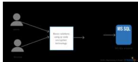
Fig System Architecture

The librarian and admin can use the software. The operations are done on daily bases and are stored in the database which can be retrieved anytime.