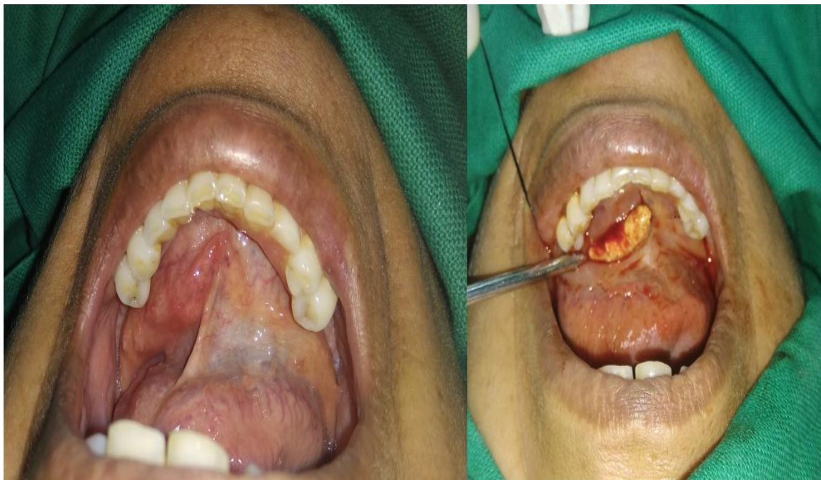
FIGURE 1: Intraoral view showing elevated mass in left side floor of mouth and via trans oral approach sialolith was delivered.

limits. Medical management was started by intravenous antibiotic for 3 days, followed by left submandibular intraoral stone extraction with marsupialization of the duct under local anesthesia. The calculus was dissected free. The sialoliths was about 2 cm [Figure 2]. The patient had smooth recovery with no complications in follow-up.