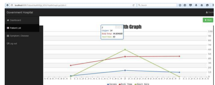
This Graph is showing Three Readings of Patient