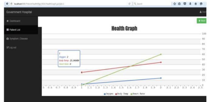
This graph is showing first Reading of Patient (With Reading one)

Here as per the (sensor) readings graph is being displayed which shows patient health record graphically (this graph automatically gets generated in our System). This readings may help doctor to monitor patients health on regular basics .