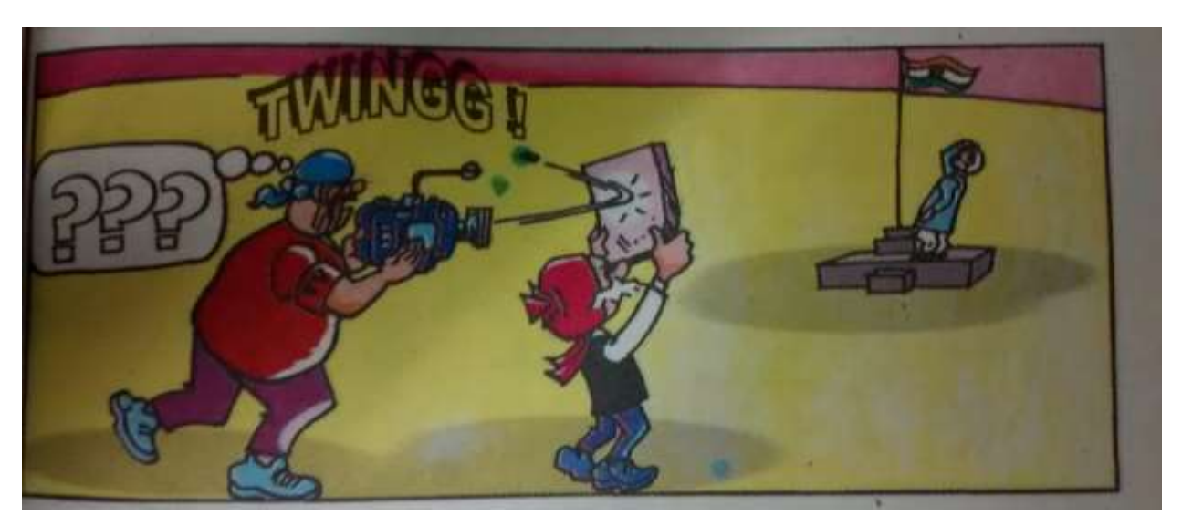
FIG.3 'Tricolor', Chacha Choudhary (Diamond Comics -1601)

Nehru defined the eve of independence as 'tryst with destiny' : "A moment comes, which comes but rarely in history, when we step out from the old to the new, when an age ends, and when the soul of a nation, long suppressed, finds utterance"(qtd.in Varma,1998). As the Independence Day represents nationalist ideology, the day is depicted as orchestration of national prosperity, progress and national unity. Due to the semiotic profuseness of Independence Day, it becomes a site of contestation over national identity. In the story, the flag hoisting is deployed to notify the nation as threatened by the anti-national agents only to be consolidated. The seeming threat to the nation is used to naturalize the hegemonic position of the middle class: recognition of the threat is