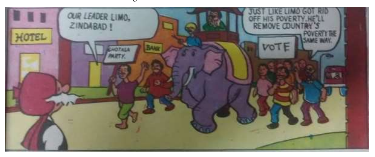
Fig.9 'Candidate for Parliament' Chacha Chaudhary (Diamond Comics- 1753)

The first panel depicts Chacha Chaudhary and Sabu being approached by the city-based politician for help. Sabu makes fun of the Indian political culture by anticipating the sudden arrival of the politician as hint of upcoming elections. What is suggested indirectly in derision of politicians is that politicians show their concern with the masses only when elections are near. The politician Rai himself clears misunderstanding about his sudden arrival. He requests Chacha Chaudhary to trace the criminal who has stolen money from his office that he has collected for campaigning in the parliamentary elections. Chacha Chaudhary, who never takes side of evil forces, instantly agrees to help him in the moment of crisis. He