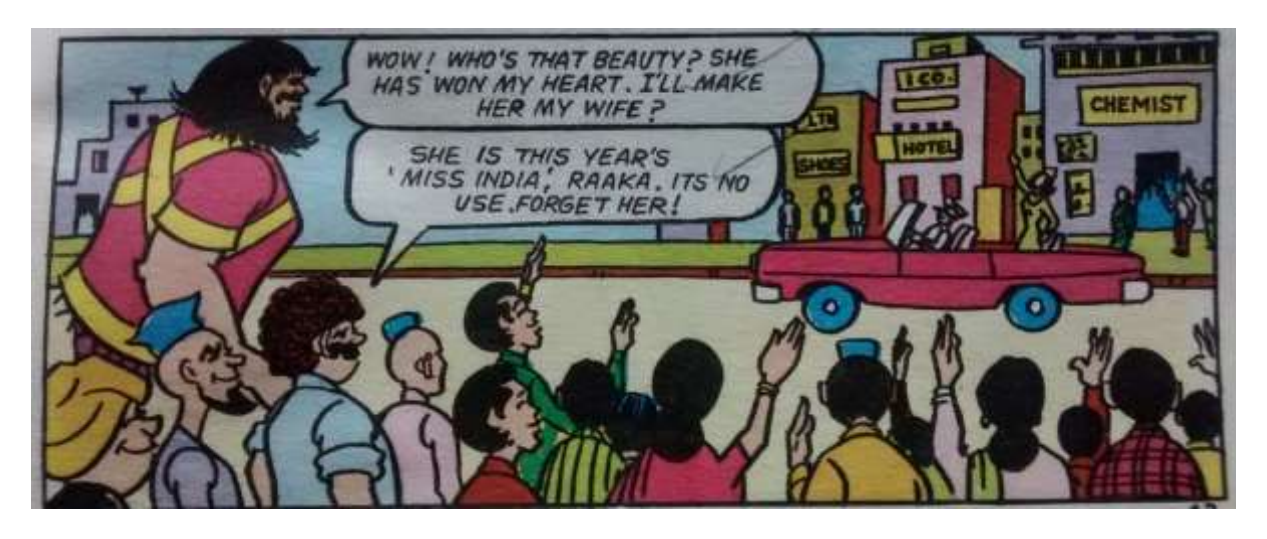
Fig.11 Raka on Rampage Chacha Chaudhary (Dimond Comics -883)

middle class space. Their forms of protest are seen as criminal activities and are, therefore, required to be suppressed for national security.