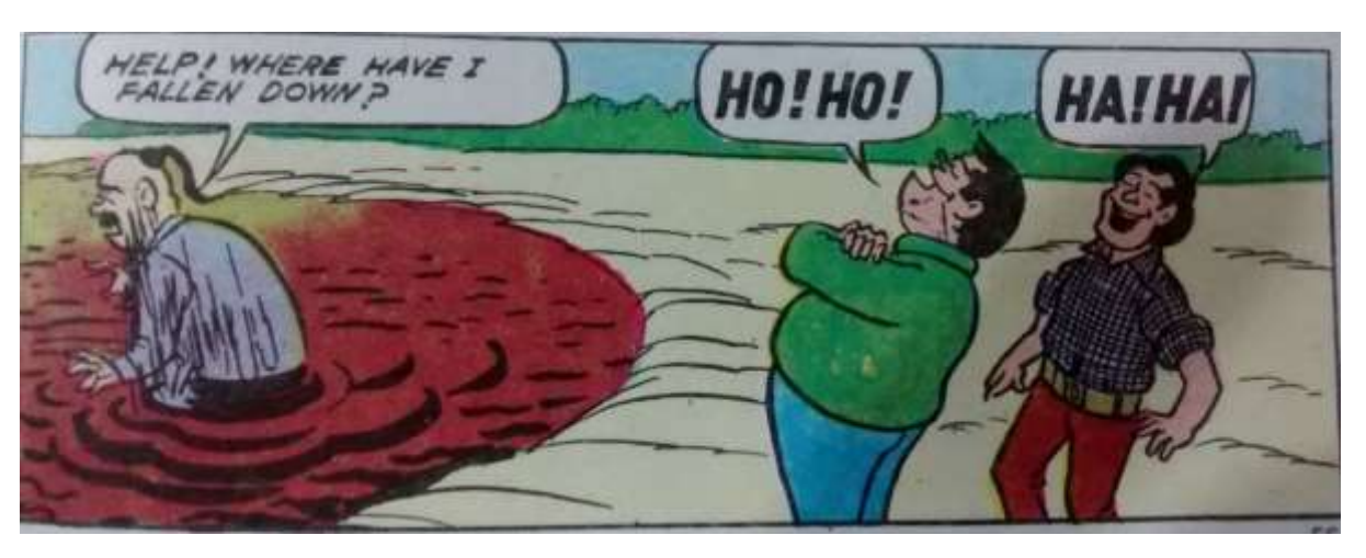
Fig.12 'Class Bunkers' Chacha Chaudhary (Diamond Comics-556)

The two characters misguide the blind man who eventually falls in dirty water and steals the stick of an old woman who cannot walk without the stick. Such delinquency is perceived as trivial and pardonable crime. Through depiction of such anti-social behavior, the middle class youth is not projected as essentially criminal but as individuals who has lost human values and at the same time they are capable of transforming themselves. In contrary to the depiction of the middle class youth, the criminals like Raka, Gobar Singh and Dhamaka Singh are seen as permanent criminals who are inhuman and incapable of transforming themselves into good human beings. In the story the boys are humiliated and forced to mend their ways. Intimidated by Chacha Chaudhary, they submit themselves to the society's norms and promise to behave responsibly. The