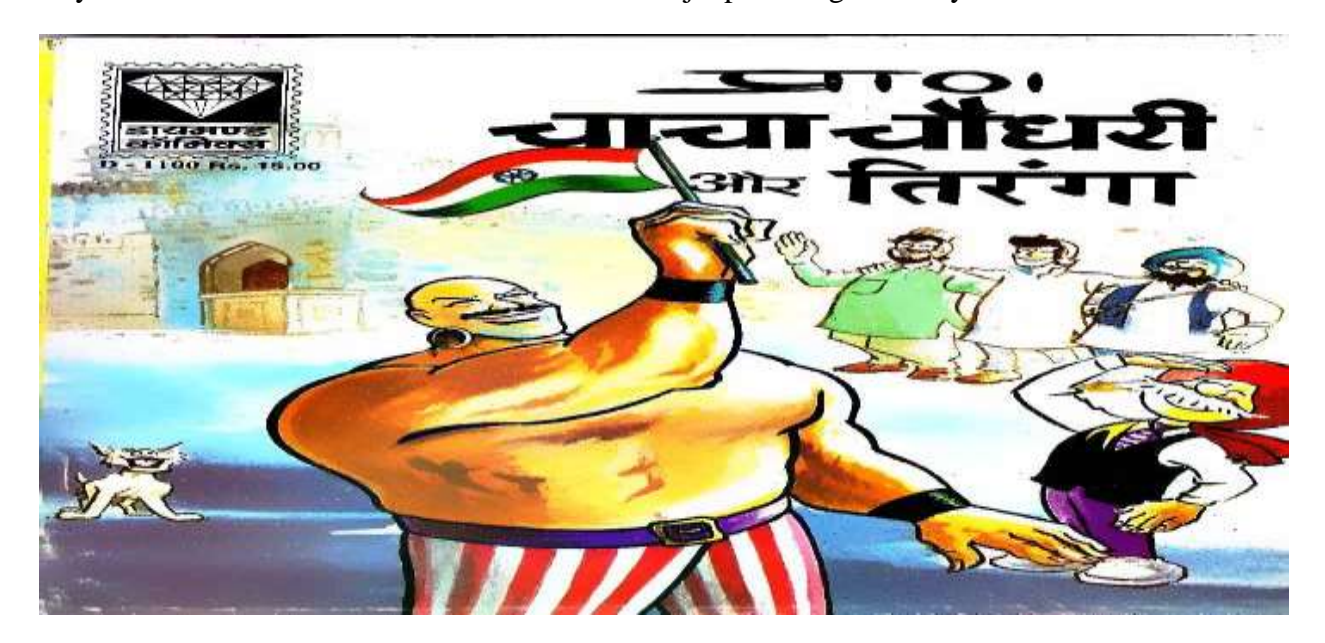
Fig.4 'Chacha Chaudhary and Tiranga' Chacha Chaudhary (Diamond Comics- 1100)

battlefield between different communities. Perceiving the nation in danger, the hero attempts to restore harmony in the society which he believes is disturbed by some criminal minded individual. The hero traces the criminal who has provoked the incident and reprimands the Hindu, Muslim and Sikh for distrusting each other and jeopardizing the unity of the nation.