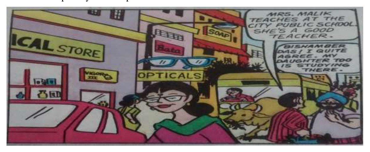
Fig. 10 'Raka on Rampage' Chacha Chaudhary (Diamond Comics-883),

living standard of the poor but in practice the sight of the poor is despised and taken as obstacle in the realization of the middle class dream of the nation. A concern for the poor came to be perceived by both the state and the middle class as "an abstraction, an unavoidable hindrance best hidden, as far as possible, from view" (verma1998:83).