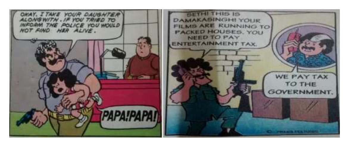
Fig.8 Gobar Singh and Dhamaka Singh, Chacha Chaudhary (Diamond Comics-1615,1354)

character of Gabar Singh from the Hindi Movie Sholay (1998:153-8). He argues that the character of Gabar singh embodies the conflict between the middle class oriented state and the political assertion of the marginalized class. The political assertion of the marginalized class manifests in the form of terrorizing the ruling class and extortion of payment from the rich people.