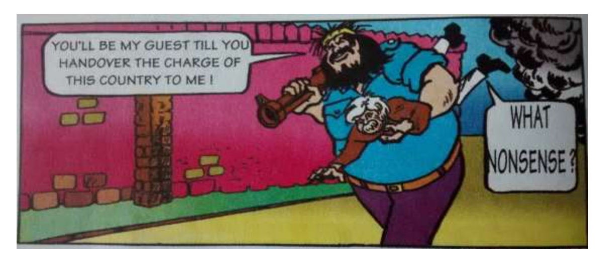
Fig. 7 'Chacha Chaudhary and Raka's Anger' Chacha Chaudhary (Diamond Comics-1491)

perception of their conflict with the marginalized classes as permanent conflict—a problem that is permanently part of the Indian society. In several stories he is seen as a part of a conspiracy hatched by other outlaws to destabilize the nation in order to gain political power