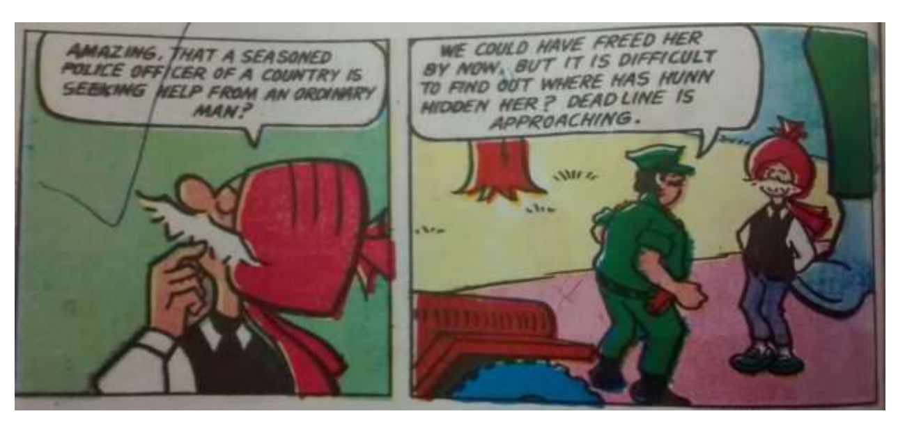
Fig.6 'Hunn the Great' Chacha Chaudhary (Diamond Comics, DE-832)

In the entitled 'Chacha story as Chaudhary and Scotland Yard' Chacha Chaudhary (Diamond Comics-739), the police is ridiculed as incapable of solving the social issue. The story begins with a robbery in a rich family which becomes viral through media. Due to widespread criticism of the state's failure to curb criminal activities, the state deploys several detective agencies including CBI, Scotland Yard to trace the criminal. The failure of these agencies to solve the mystery of robbery deepened the crisis, maligning the image of the state as 'protector and guardian' of its citizens. In another two stories entitled respectively as 'Fugitive' and 'Tear Gas' Chacha Chaudhary (Diamond Comics- 1753), the police is caricatured as absent-