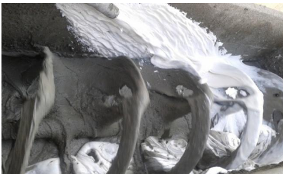
Fig. Mixing of CLC with foam

unexpected sort in comparison to typical solid blend. It has stationary external drum not at all like the moving drum of solid blend, and internal helix which is rotating at 250-300 RPM. The helical operation is utilized as opposed to spinning whole drum with the goal that the rises in the froth don't get scattered. In the event that the drum is utilized for blending rather than helix the air pockets would get scattered because of diving of material on each other.